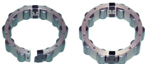
Easy-to-assemble integrated cage clip and precision machined brass cage

Well protected – There are many sealing options. High-temperature-resistant ATL triple labyrinth seals perform reliably in aggressive environments. KPS Kevlar packing seals or high temperature flinger seals can withstand even the harshest environments